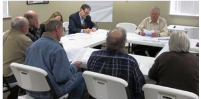
Commissioner (top left) hears concerns and recommendations from 20 members of farm groups at the April 10 meeting in Central MN.

He agreed at the meeting that 30% concentration of milk production by a corporate producer and vertical integration between producer and processor send up red flags to require closer scrutiny in the exemption process. (See other side.)